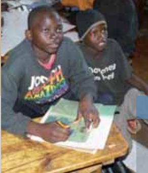
Attentive students in class