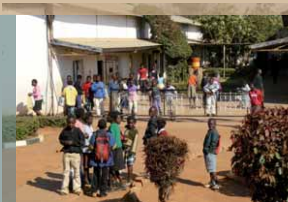
Kabwe-Main: The BOCCS-school downtown