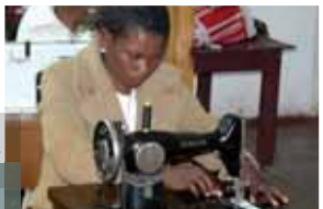
Training in the domestic economy class

BOCCS itself is able to offer a one-year-long practical apprenticeship, but without being licenced in the end. In a domestic economy class, girls may learn how to work fabrics (tailoring, sewing), as well as crotcheting and knitting. In the school's wood workshop, boys may learn technical skills such as wood-working.