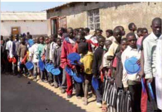
The students stand in line for their meal.

The meal program became necessary, because the majority of the children from the compounds suffer from malnutrition. Furthermore, it is the ideal complement to the sponsorship program. It allows us to give local families, who take in a sponsored child (AIDS-orphan), a monthly compensation for their food expenses. Then, the sponsored child and all the other children of that family can go to one of the BOCCS schools. On top of that, all children at BOCCS daily receive a warm meal.